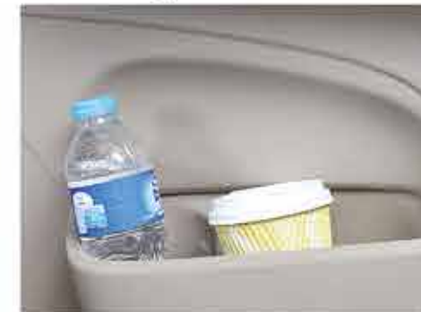
REAR DOOR POCKET