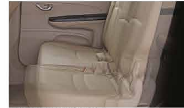
SLIDING SEATS 2ND ROW The 2nd row smoothly slides backwards and forwards to adjust to your passengers comfort level.