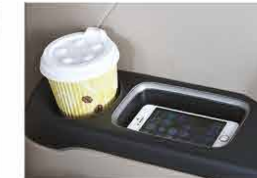
3rd ROW MOBILE AND GLASS HOLDER