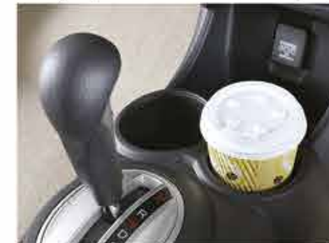
FRONT CUP HOLDER

10 CUP HOLDERS Storage options abound with 10 handy cup holders found throughout the BR-V.