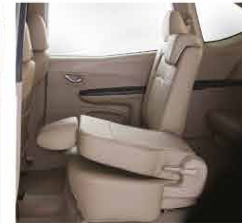
50:50 FOLDING 2ND ROW