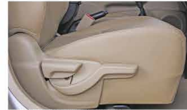
DRIVER SEAT HEIGHT ADJUSTER Feel at home on every journey by adjusting your seat the way you like.