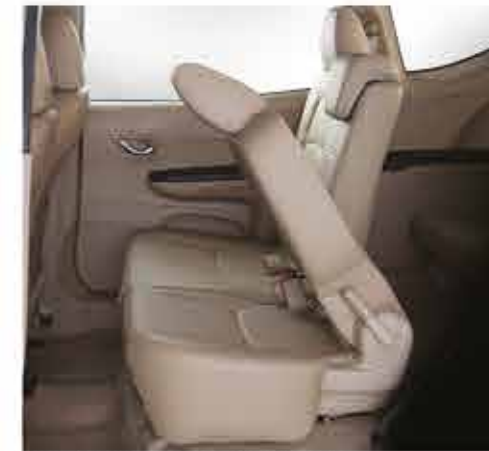
ONE TOUCH TILT 2ND ROW