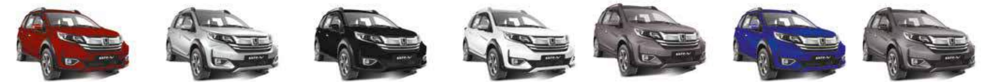
Carnelian Red Lunar Silver Metallic Crystal Black Pearl Teffeta White Modern Steel Metallic Brilliant Sporty Blue Urban Titanium

Honda Atlas Cars (Pakistan) Limited reserves the right to change or modify equipment or specifications at any time without prior notice. Details, colors, descriptions and illustrations are for information purpose only. Optional features are subject to prices. For further details please check with your nearest Honda dealer or visit www.honda.com.pk