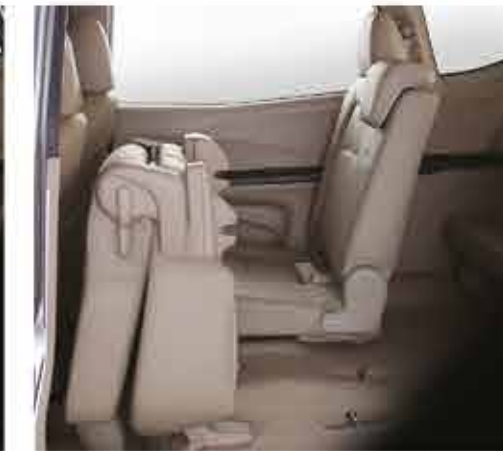
ONE TOUCH TUMBLE 2ND ROW SEAT

10 CUP HOLDERS Storage options abound with 10 handy cup holders found throughout the BR-V.