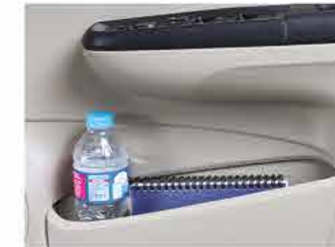
FRONT DOOR POCKET