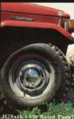
H78x15 4-Ply Rated Tires†