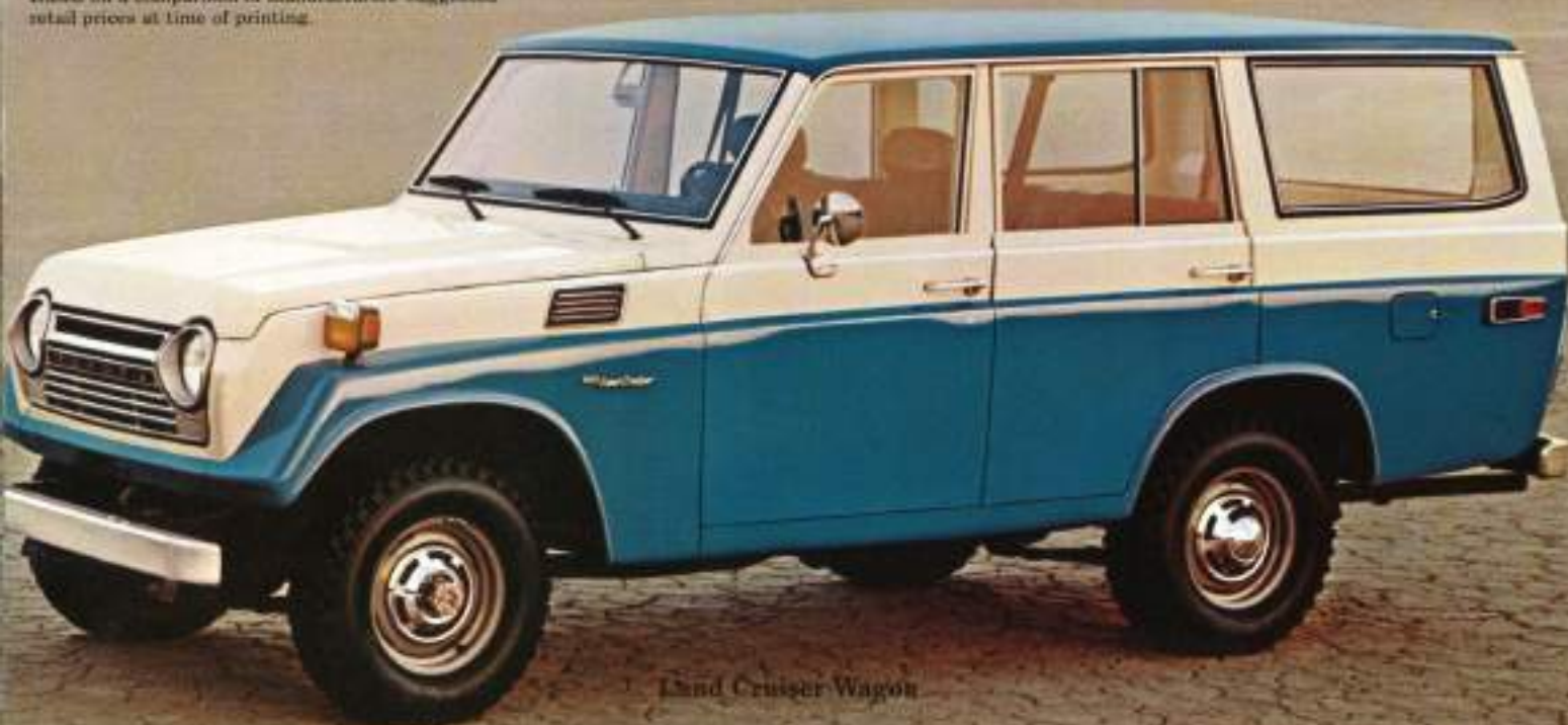
Land Cruiser Wagon

But above all, remember—the Toyota name has come to mean value, dependability and most of all—quality. If you can find a better built 4x4 than a Toyota, buy it.