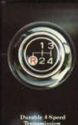
Durable 4-Speed Transmission