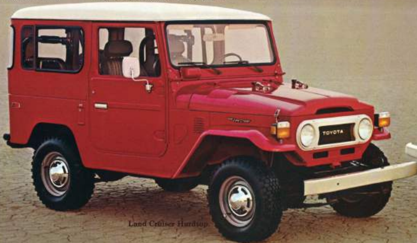
Land Cruiser Hardtop

We equip Toyotas with so much built-in value because our research has shown us that that's the way you want a quality 4x4 equipped.