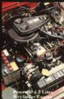
Powerful 4.2 Liter 6-Cylinder Engine

Specifications, equipment and prices are subject to change without notice. The names and situations portrayed in this brochure are fictional and are not intended to represent actual persons.