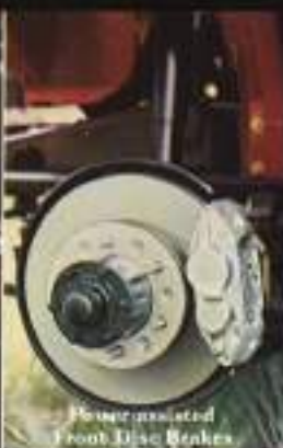
Power-assisted Front Disc Brakes