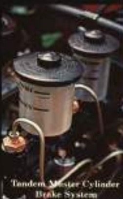
Tandem Master Cylinder Brake System