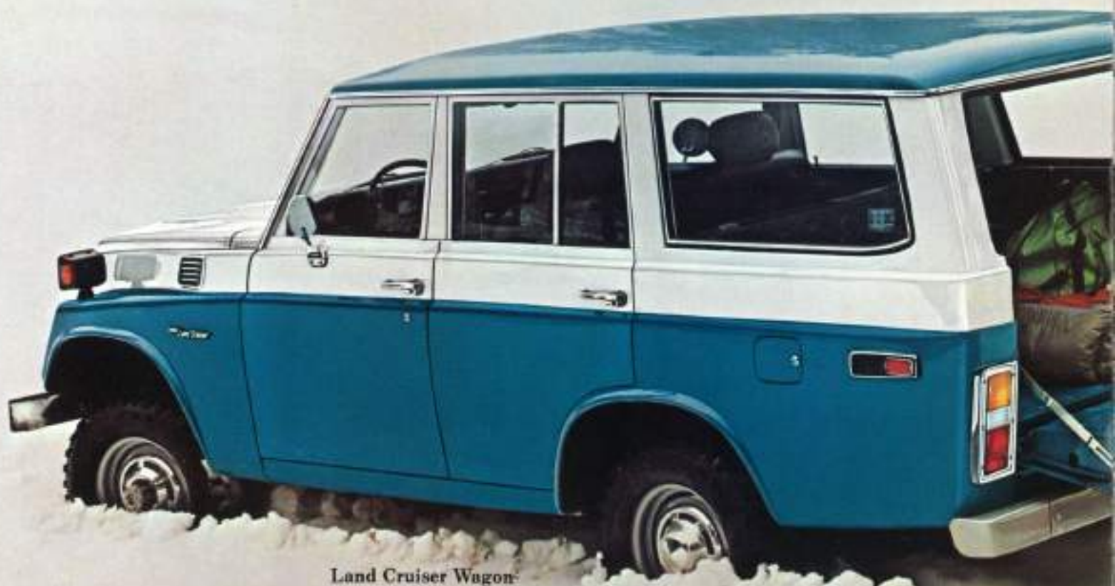
Land Cruiser Wagon

Talk about comfort. Our Land Cruiser came with front and rear heaters so that everyone can stay warm, even in the coldest weather. But what's really great is that the heaters were included in the base sticker price.