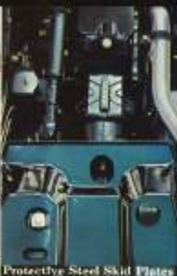
Protective Steel Skid Plates