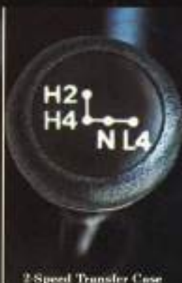
2-Speed Transfer Case