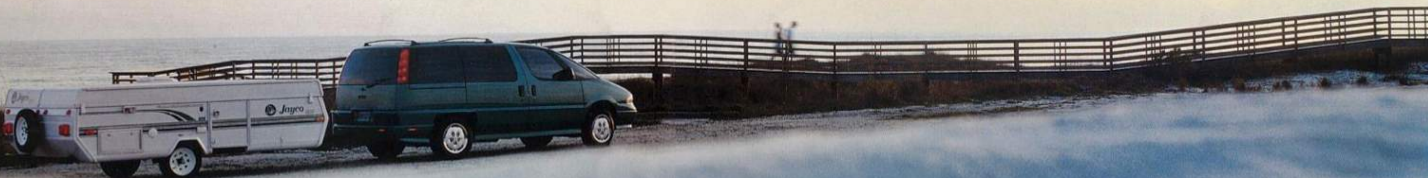
Lumina Minivan with optional LS luxury-level trim. Shown in Bright Aqua Metallic.

NOTE: The safety steps described here are by no means the only precautions to be taken when trailering. See the Owner's Manual for the Chevy vehicle of your choice for additional guidelines and trailering tips.