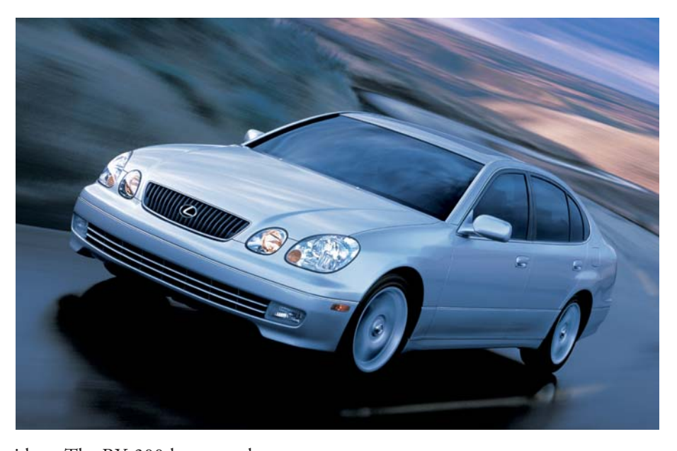
Below left: The awesomely smooth and even quieter, faster and more agile, incredibly luxurious Lexus flagship, the LS 430. Below right: the new-generation ES 300 mid-size luxury sedan. Above: The "awesome" GS 430 luxury sports sedan.

from their luxury cars. The team listened, learned and set to work. Their success is evident: The RX 300 has earned accolades aplenty and several major awards, including Best SUV of the Year and Best Luxury SUV. Bravo Lexus!