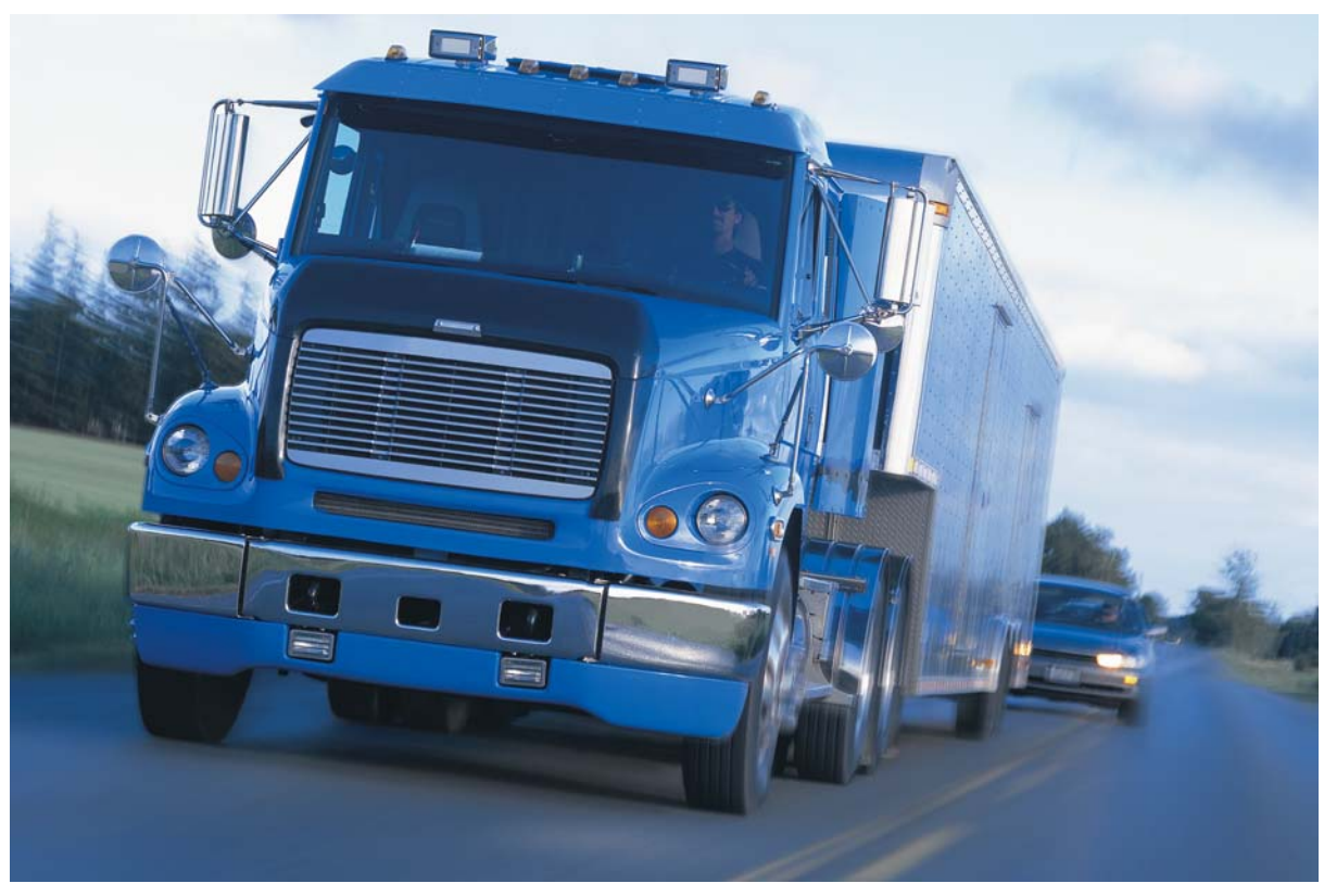
The better the handling, the better your chances.

Similarly, the RX 300's front and rear ends crumple progressively on impact – while leaving the cabin intact. The engine is designed to slide under the cabin, rather than into it. Hooks grab the hood and stop it from smashing through the windshield. There are two telescoping joints on the steering column.