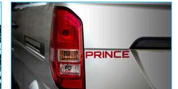
Vertical Combination Tail Lamp