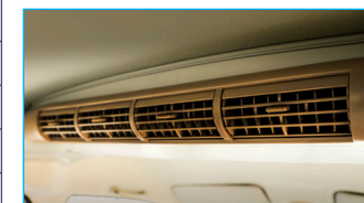
Dual Air Conditioner