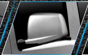
Body-Color Side Mirror