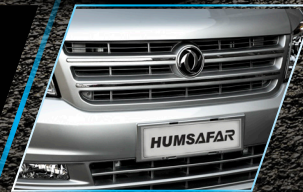
Chrome Front Grill