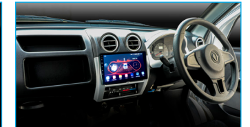
Prestige And Wider Feel