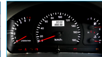
Analog Digital Cluster Meter