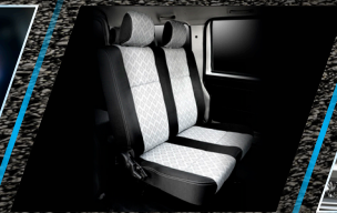
New & Improved Seats