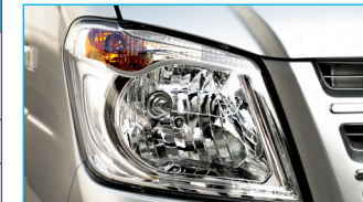
Tiger-shaped Projected Head Light