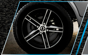
14" Alloy Rims