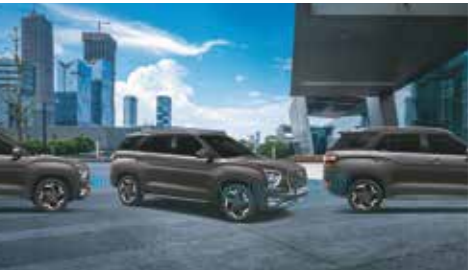
Parking assist: Front and rear parking sensors

Other features: Emergency stop signal | Speed alert system | Speed sensing auto door lock | Driver rear view monitor Impact sensing auto door unlock | Child seat anchor (ISOFIX) | Electric parking brake with auto hold