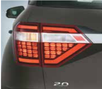
Honey-comb inspired LED tail lamps