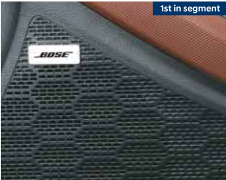
1st in segment