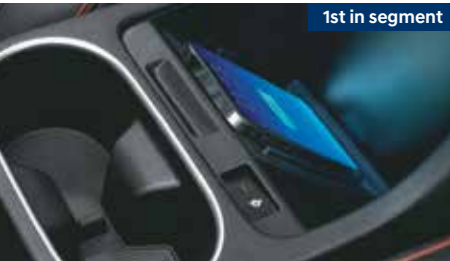
1 st & 2 nd row smartphone wireless charger