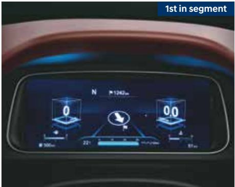
1st in segment