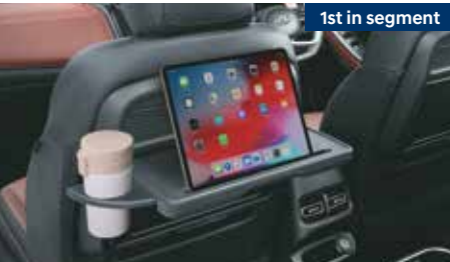
Front row seatback table with retractable cup-holder and IT device holder