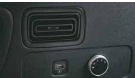
3 rd row AC vents with speed control (3-stage)