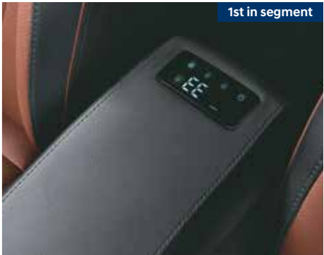
1st in segment