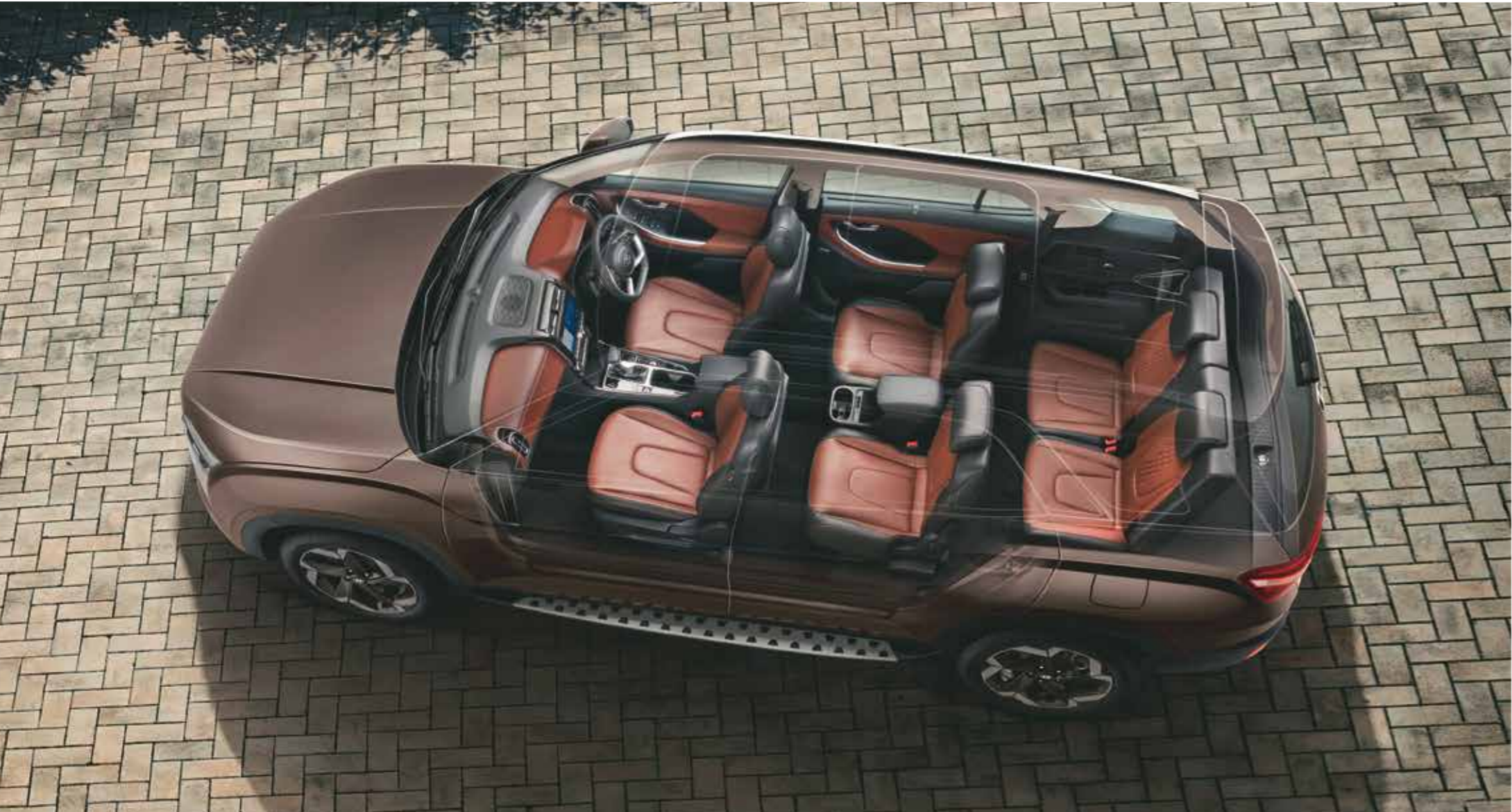
Leather pack: Perforated D-cut steering wheel | Perforated gear knob | Cognac brown and black seat upholstery | Door armrest

The interior of the Hyundai ALCAZAR immerses you in uncluttered design. Complete with premium dual tone cognac brown interiors, the 64 colours ambient lighting offers a regal touch to the cabin. Carefully selected materials accentuate the aesthetic, complete with Hyundai ALCAZAR's advanced technology, ensuring that your entertainment knows no bounds. Experience serenity thanks to a voice controlled panoramic sunroof and an auto healthy air purifier. The tranquil sanctuary is also outfitted with an HD touchscreen system with powerful Bose premium sound system, immersing you in a rich and balanced premium audio experience.