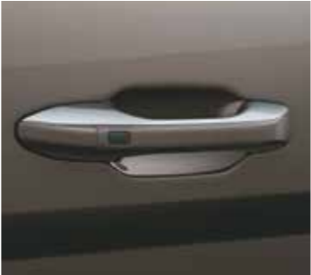
Dark chrome exterior finish outside door handles

Other features: LED positioning lamps | Crescent glow LED DRLs | Trio beam LED headlamps Dark chrome exterior signature cascading grille | LED fog lamps