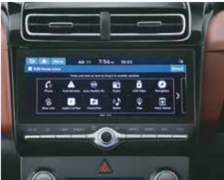
26.03 cm (10.25") HD touchscreen system