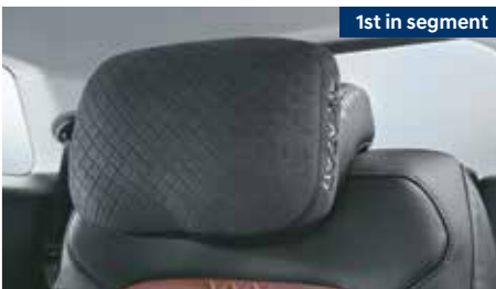
2 nd row headrest cushion