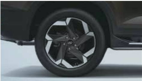
Rear disc brakes