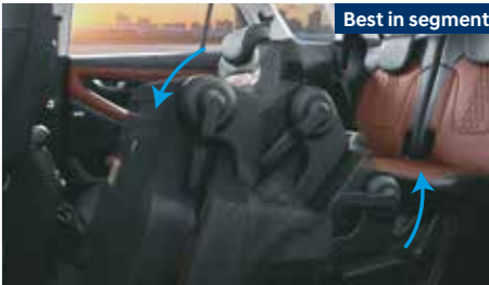
2 nd row - one touch tip tumble captain & split seats