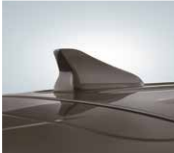
Shark fin antenna