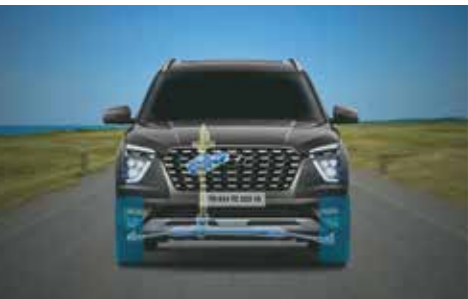
Vehicle stability management (VSM)