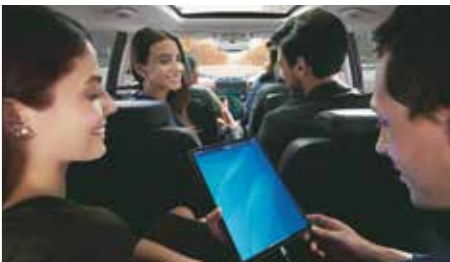
4 USB chargers for 3 rows