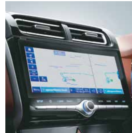
Advanced Blue Link with OTA map updates