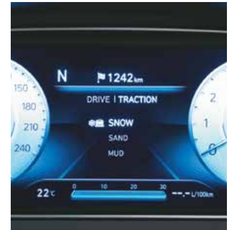
Traction control modes