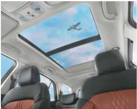
Voice enabled smart panoramic sunroof