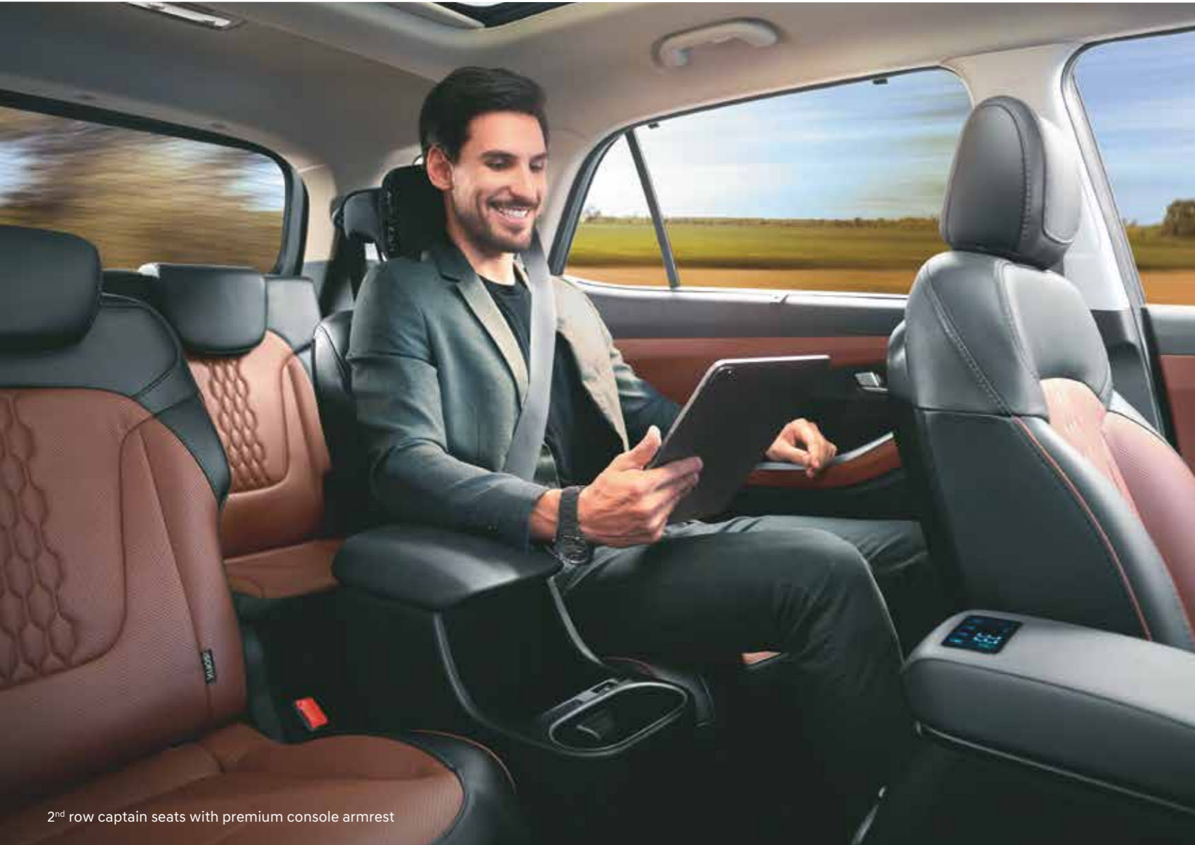
2 nd row captain seats with premium console armrest

Adore your private palatial retreat on wheels wherever the journey takes you.