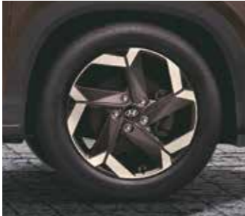
R18 (D=462 mm) diamond cut alloys