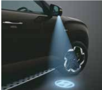
Puddle lamps with Hyundai logo projection