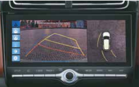
Surround view monitor (SVM)