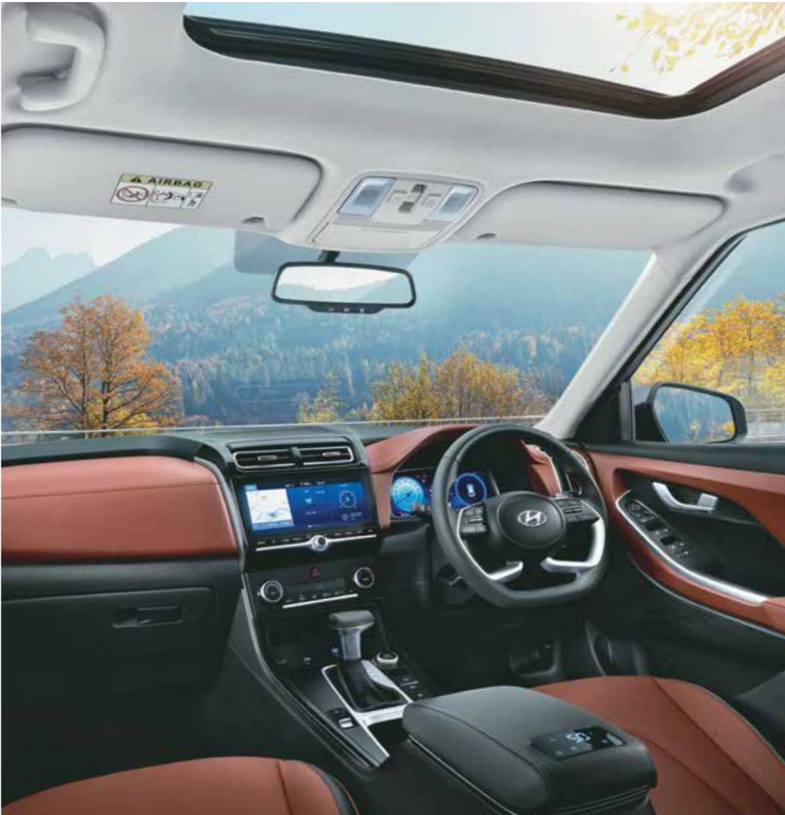
Premium dual tone cognac brown interiors