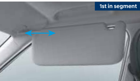
Front row sliding sunvisor