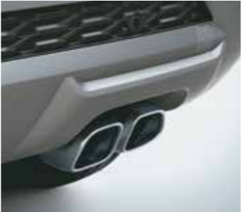
Twin tip exhaust