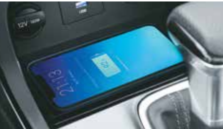
1 st & 2 nd row smartphone wireless charger