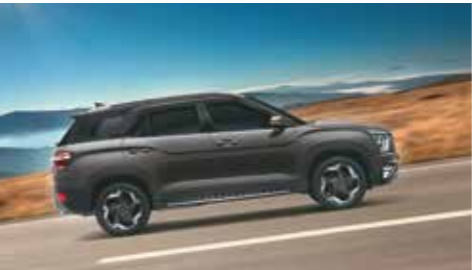
Hill start assist control (HAC)