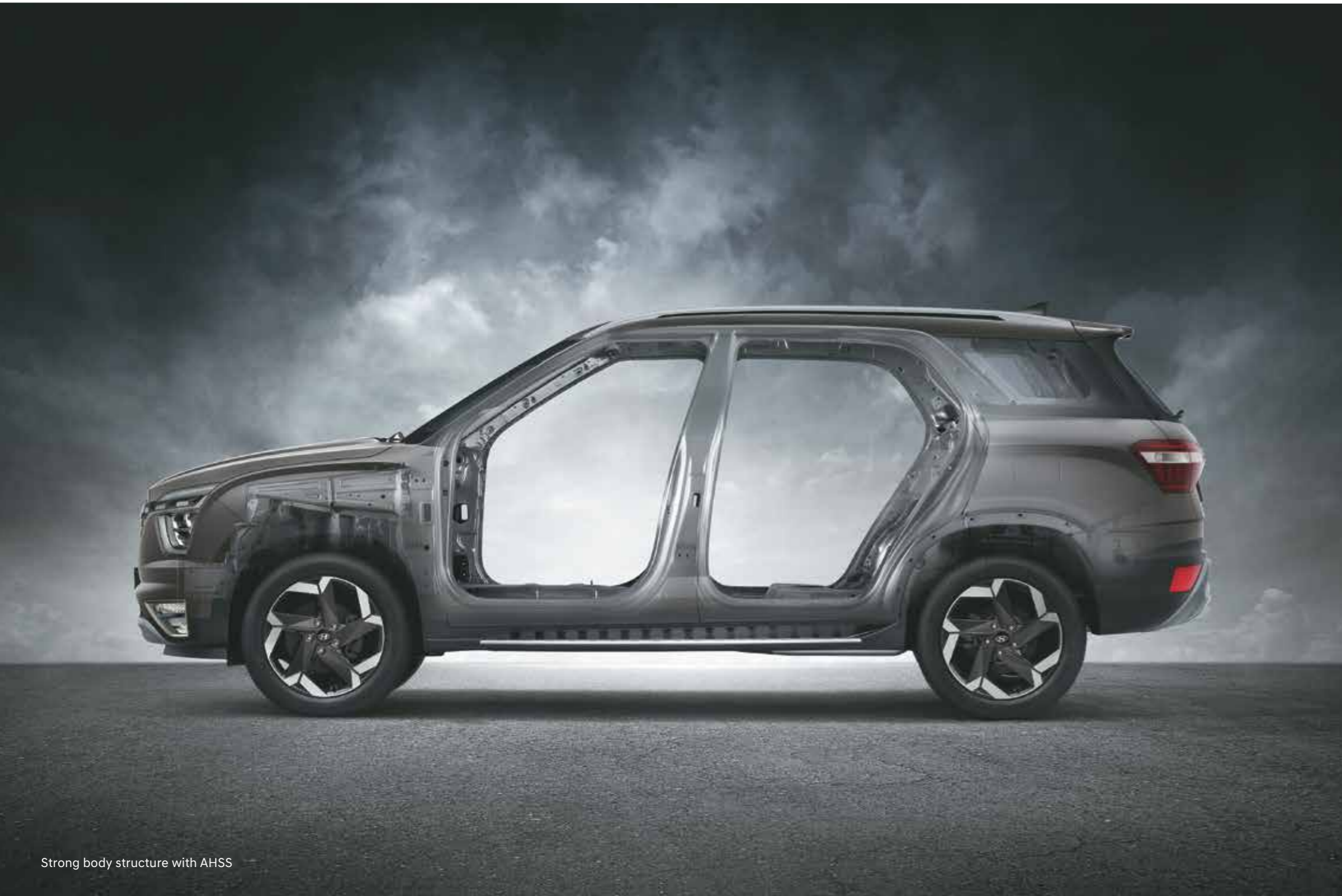
Strong body structure with AHSS