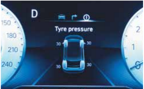
Tyre pressure monitoring system (Highline)