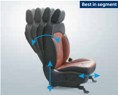
Best in segment