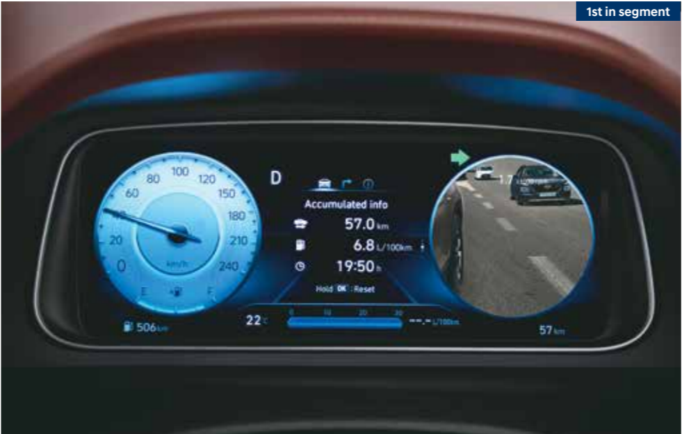
Blind view monitor (BVM)

Each element of the Hyundai ALCAZAR has been designed to provide excellence, in comfort and in safety. Complete with highly accurate front & rear parking sensors and state-of-the-art security alerts like speed alert system, you're always one step ahead of unexpected events on the road. Each journey in the Hyundai ALCAZAR inspires awe and admiration as it carries passengers in uncompromised safety.