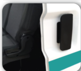
INTELLIGENT POWER SLIDING DOOR SYSTEM (OPTIONAL)