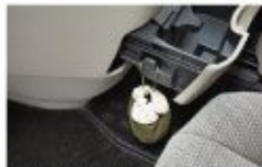
"TEH-TARIK" / "TAR-PAU" HOOKS (X2)