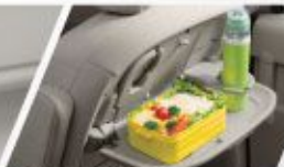
PERSONAL TABLE (X2) CUP HOLDER (X4)