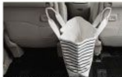
MULTIPLE WAYS TO USE BOTH HOOKS