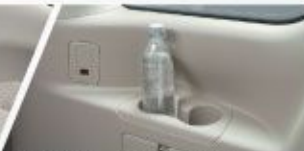
3RD ROW BOTTLE HOLDER (X4)