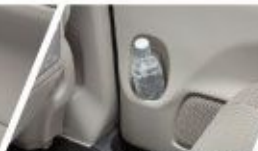
2ND ROW BOTTLE HOLDER (X2)