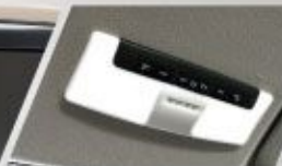
LED ROOM LAMP*