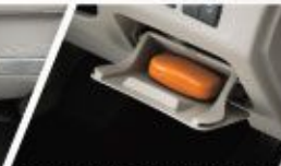
"SMART TAG" COMPARTMENT