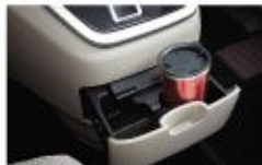
FRONT CUP HOLDERS (X2)

14 cup/bottle holders. 10 storage compartments. 4 "teh tarik/tar-pau" hooks. Plenty of storage for everything!