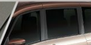
V-KOOL 4MIL SECURITY FILM TINTING*

Actual car specifications may vary from picture shown. *Available for Premium Highway Star only.