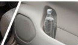
FRONT ROW BOTTLE HOLDER (X2)