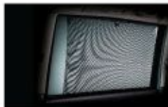
2ND ROW SUN SHADES