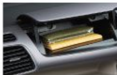
FRONT PASSENGER COMPARTMENT