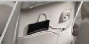
SEAT BACK POCKET (X4)