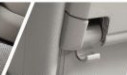
"TEH-TARIK" / "TAR-PAU" HOOKS (X2)