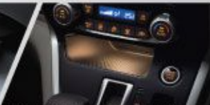
CENTER CLUSTER COMPARTMENT