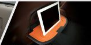
"TECH-ON" TRAY MAT*