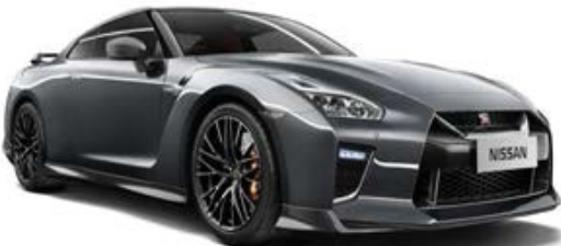
Gun Metallic (KAD)