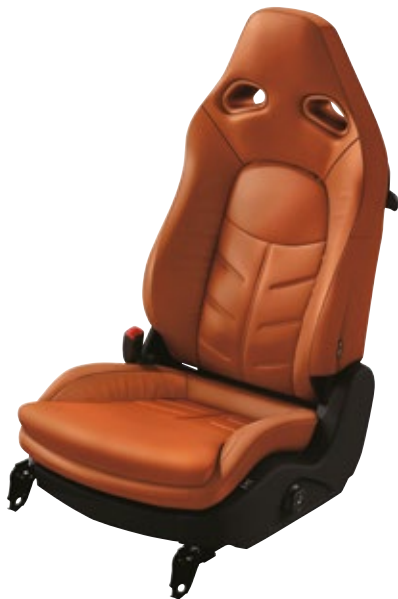
Tan Semi-aniline leather accented