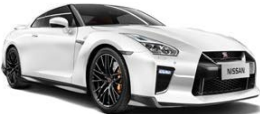
Storm White (QAB)