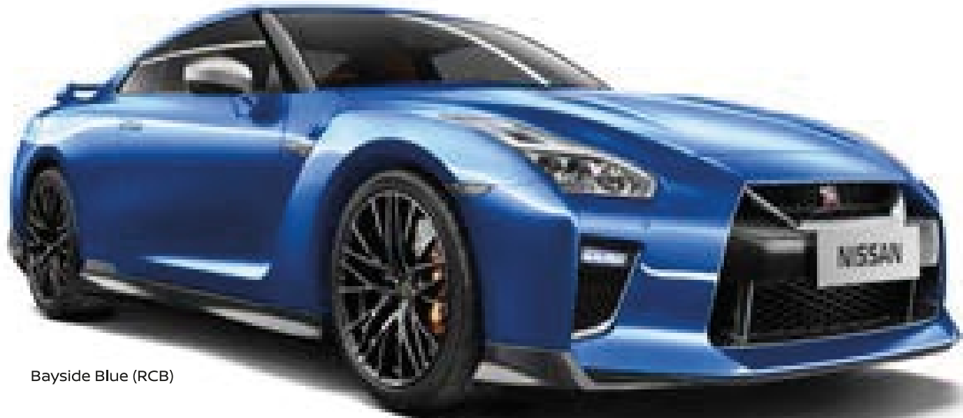
Bayside Blue (RCB)