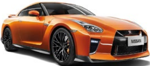
Katsura Orange (EBG)