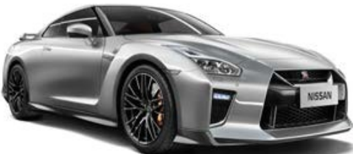
Super Silver (KAB)