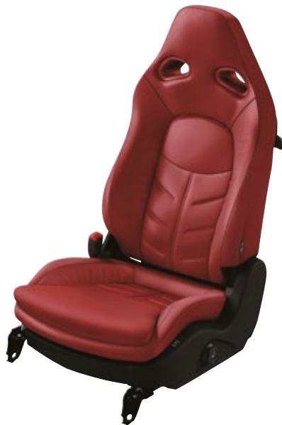
Amber Red Semi-aniline leather accented