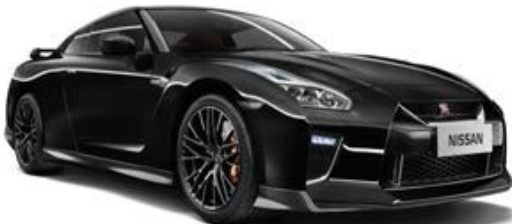
Pearl Black (GAG)