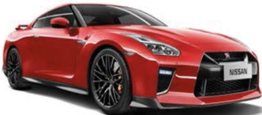
Vibrant Red (A54)