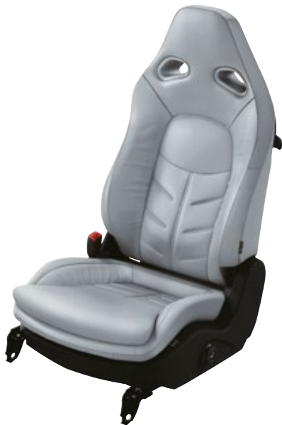
Urban Grey Semi-aniline leather accented