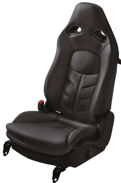
Samurai Black Semi-aniline leather accented